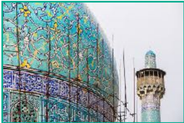
Imam Mosque Dome - Esfahan

Prior to going to Iran, I thought it was mostly desert sprinkled with blue domes covered with tiles in shades of blue. I did see and enjoy those blue domes as well as desert areas.