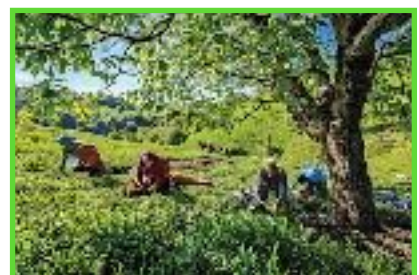
Left to right: Driving in the Hyrcanian forests (UNESCO), Growing Rice, Harvesting tea