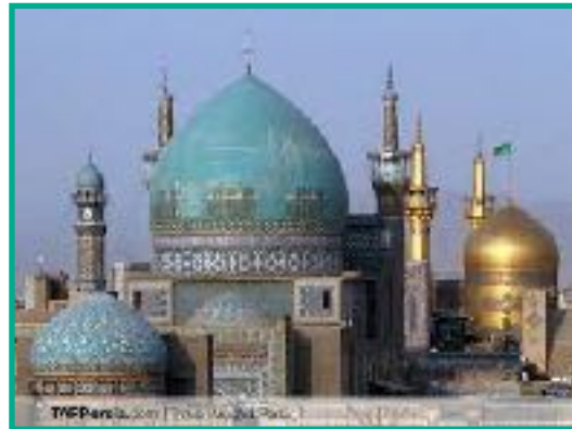
Goharshad Mosque in Mahsad

However, I found Iran to have much more including mountains, forests, rice paddies and even small tea plantations in the northern part of the country around the Caspian Sea